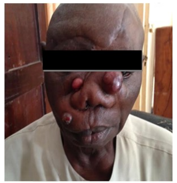
Fig.1a (Pre-surgery 14months ago)

facial scars, deviated nasal dorsum to the right side and partial obstruction of the nasal cavities with greatly reduced nasal patency. Of note was a rectangular scalp scar that suggested previous skin flap mobilization for possible wound repair and a skin donor site on the left thigh for possible skin cover in one of his surgeries as shown in Fig.1a below. He had various investigations done, which included computerized tomographic scan of the paranasal sinuses and brain that showed no brain, bone or sinuses involvement. Post excision biopsy as shown in fig. 1b and the histology findings had features consistent with that dermatofibrosarcoma protuberans (Fig.1c). Patient was referred to another Healthcare facility for postoperative adjuvant radiotherapy.