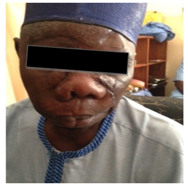
Fig. 1b (Post-surgery14months ago)

Fourteen months later, he again presented with a huge ulcerating tumour that was foul smelling. About 50% of his mouth was covered by this tumour preventing him from feeding well per os (Figures 2a and 2b). His medical history has shown that he couldn't have the recommended adjuvant radiotherapy owing to financial constraints.